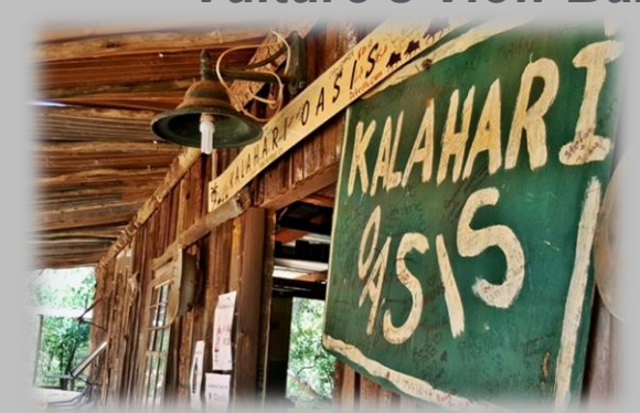
Kalahari Oasis Bush Pub