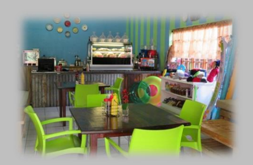
Boeretroos Coffee Shop