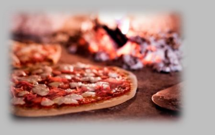
Le Fera Restaurant