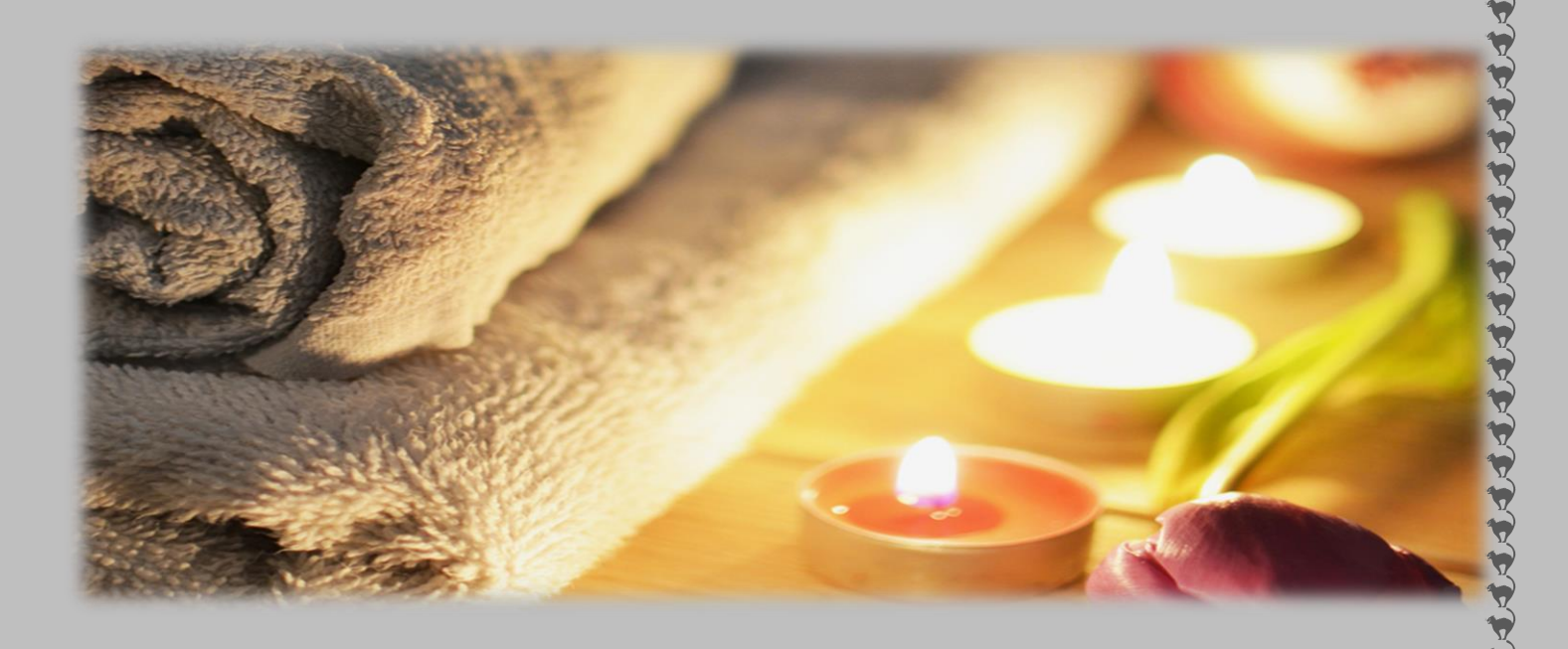
Mbali Day Spa