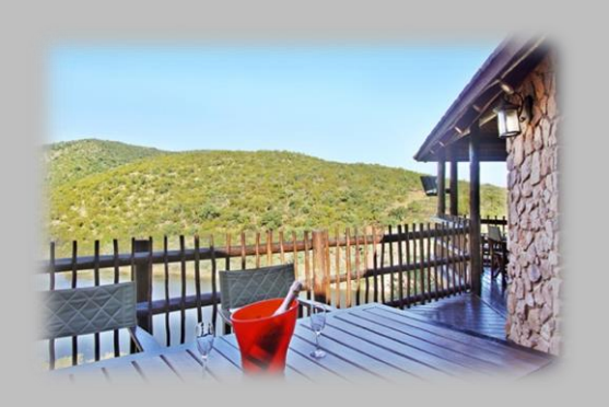
Vulture's View Bar