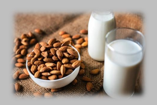
Le Fera Plaaswinkel / Farmshop